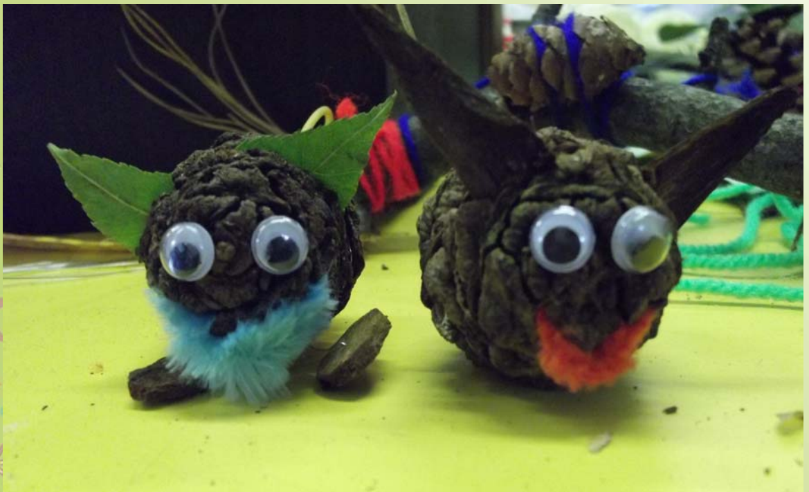
Two 'nut bugs' created at the Stoke Park half term event in October

The ultimate aim is that by the end of the project we will have created a legacy of motivated people across communities who realise the value of their local natural environment and have the tools and training to continue caring for it.