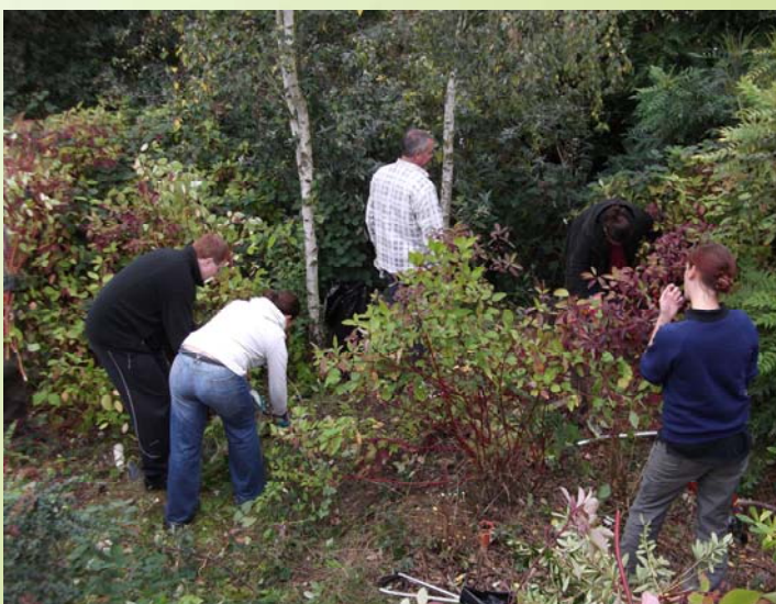
Above right: film making at our launch, Alderman Canal Above: clearing Kelly Road, the Triangle Estate

We held one of our October half term events in the 'Our Space' shop on Dickens Road. Lots of families attended, the children loved the stories and collecting huge bags of natural things to make into crafts!